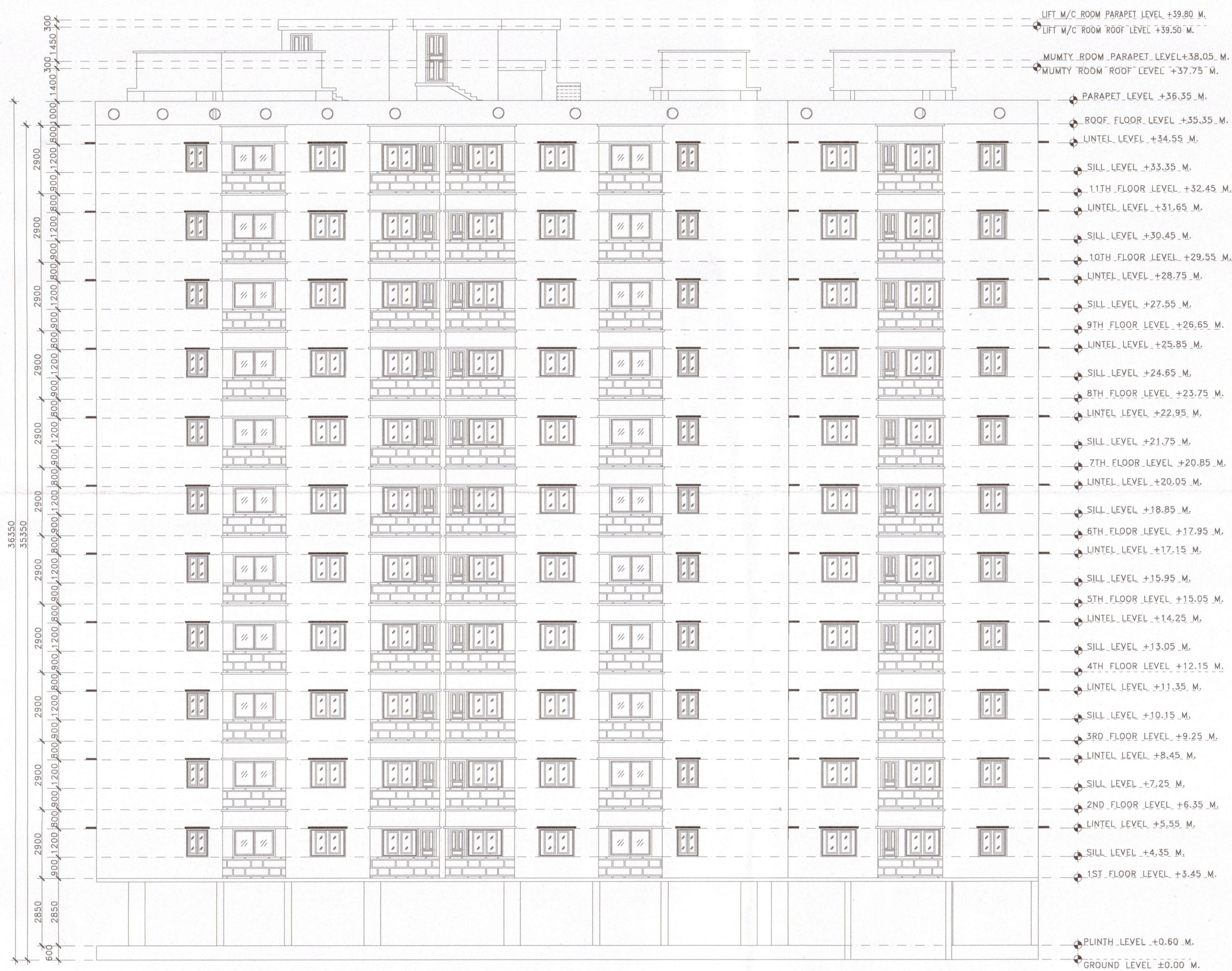
(A) FRONT SIDE ELEVATION SCALE: 1:100